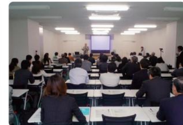
For general public