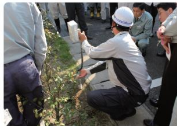
For municipalities and an experts